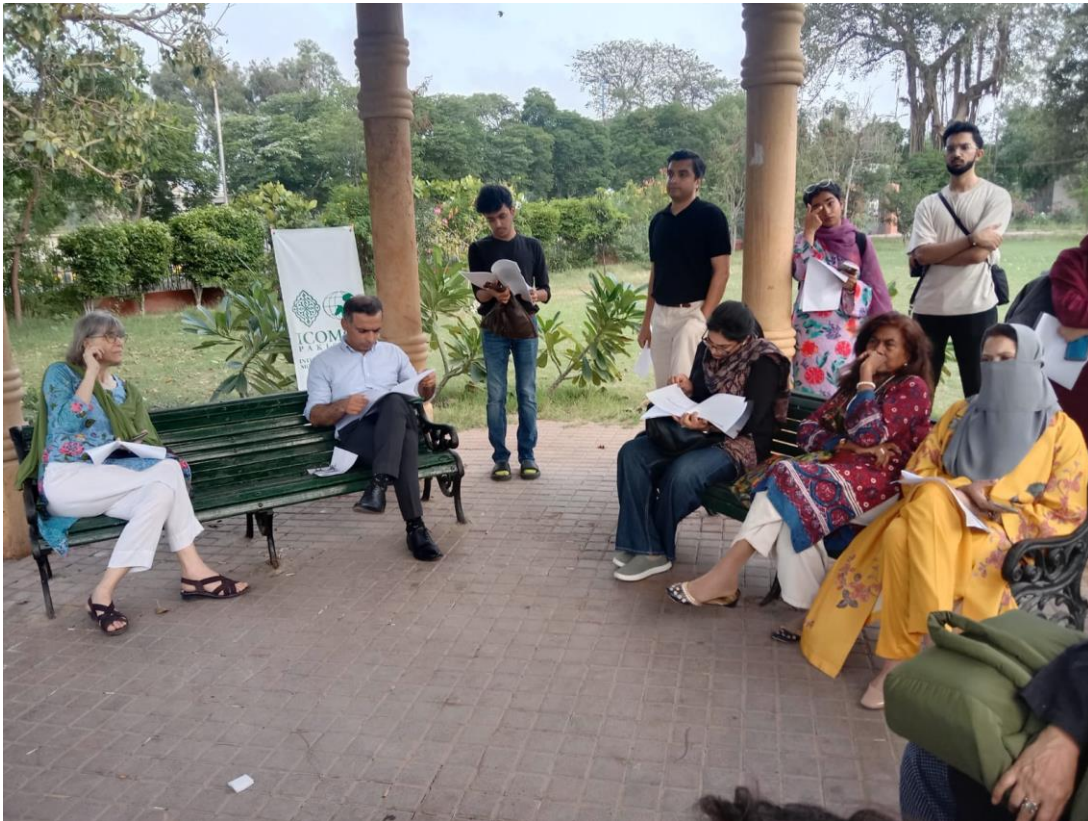
Fig 6.0: Participants observing maps of Banyan Trees in Old Clifton Karachi.