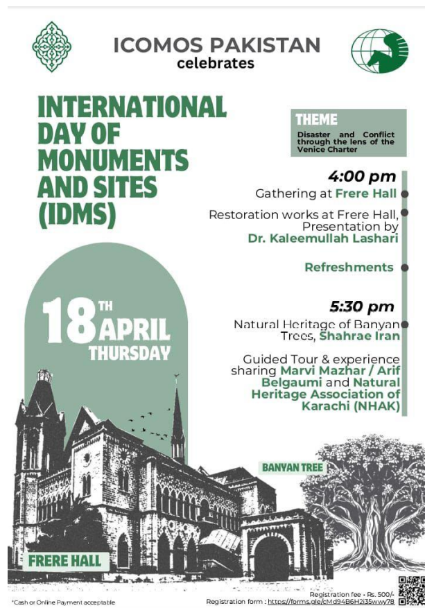
Fig 1.0: ICOMOS poster designed by the ICOMOS team Pakistan

The International Day of Monuments and Sites is celebrated globally on 18 th April 2024 and is an event annually organized by the ICOMOS International, bringing together professionals, conservationists, academics and students to identify, recognize and value the heritage. This year the theme of the International Day is ‘ Disaster and Conflict through the lens of the Venice Charter ’. The event was organized and coordinated by the Executive Council of ICOMOS Pakistan, included two important heritage sites which are both cultural and natural heritage; Frere Hall Building and The Banyan Tree Project.