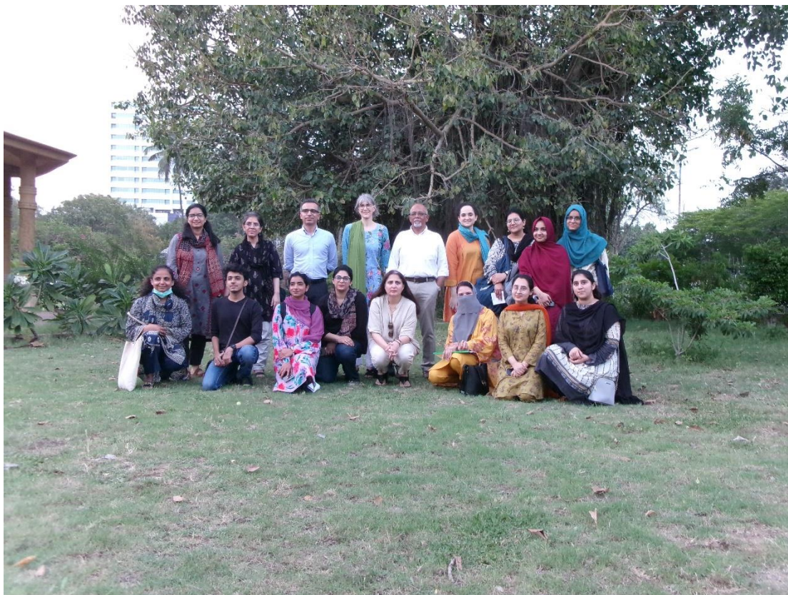
Fig:6.0: Participants group photo